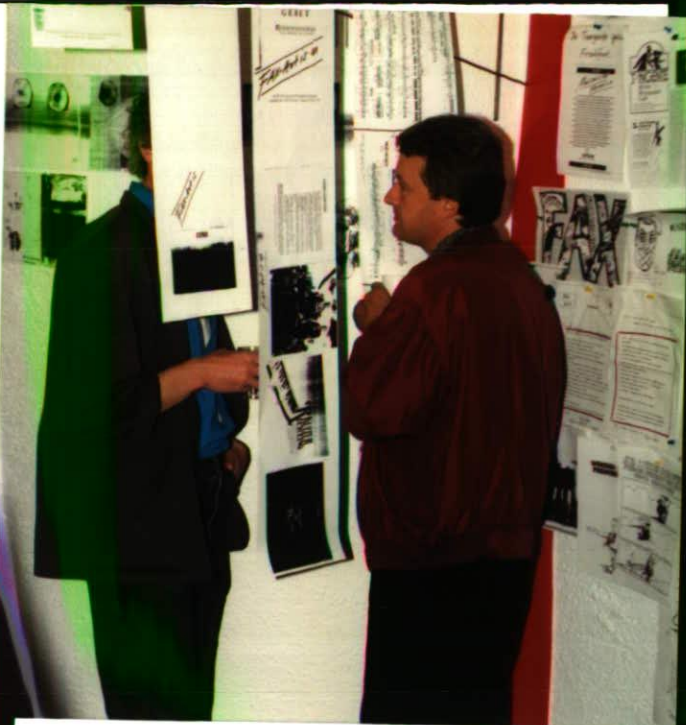
FAX-ART 1990 16. Juni 90