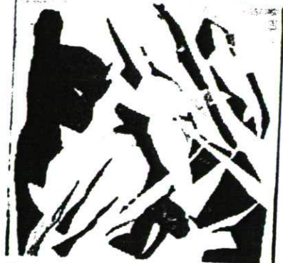
CIRCE, from Odyssey Series, wool, cotton, silk and vis- cose, 2.40 x 2.40m, 1999